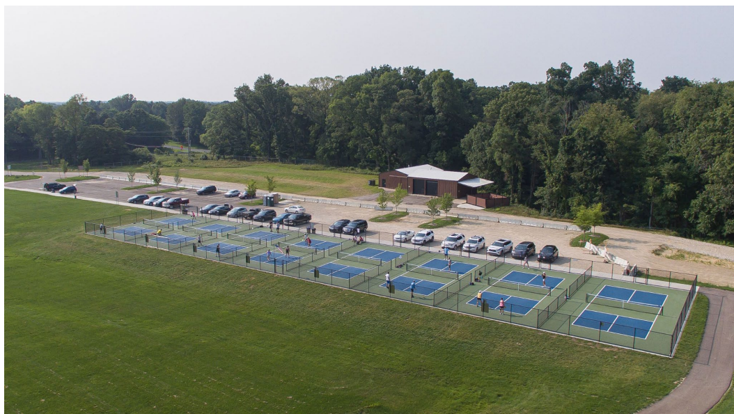
View of eight pickleball courts and adjacent parking lot at 6th Street Park